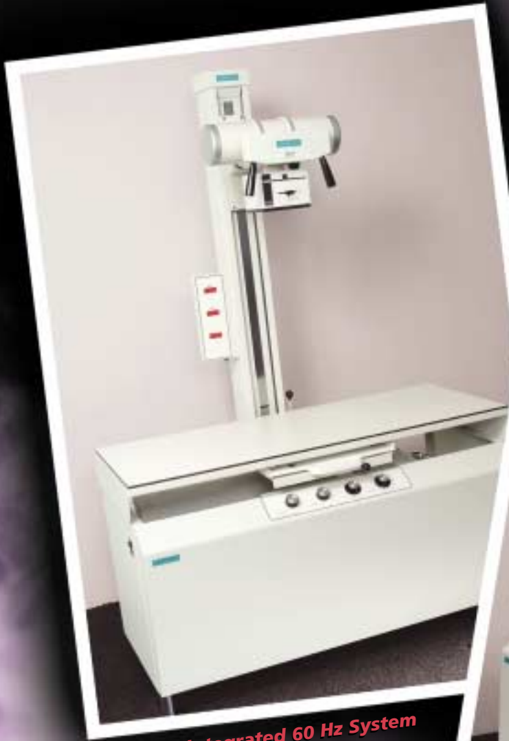
AV2 Integrated 60 Hz System